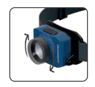
Adjustable beam angle 10°-60°

ZOOM has a modern, streamlined, and compact design with a remarkably low weight, only a little above 100 g which means that you hardly notice you wear it. The 30 mm headband is soft and durable and easy to adjust in the requested length. The lamp head is flexible and can be adjusted 45° to get the best possible lighting angle during work.