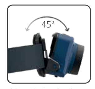
Adjustable lamp head

It has got its name "ZOOM" because the beam angle can be "zoomed" in and out according to the nature of the job to be done. Thus, the beam angle can be adjusted from 10^\circ providing a very long beam distance of 80 m to a much wider beam angle of 70^\circ providing a shorter beam distance of 30 m.